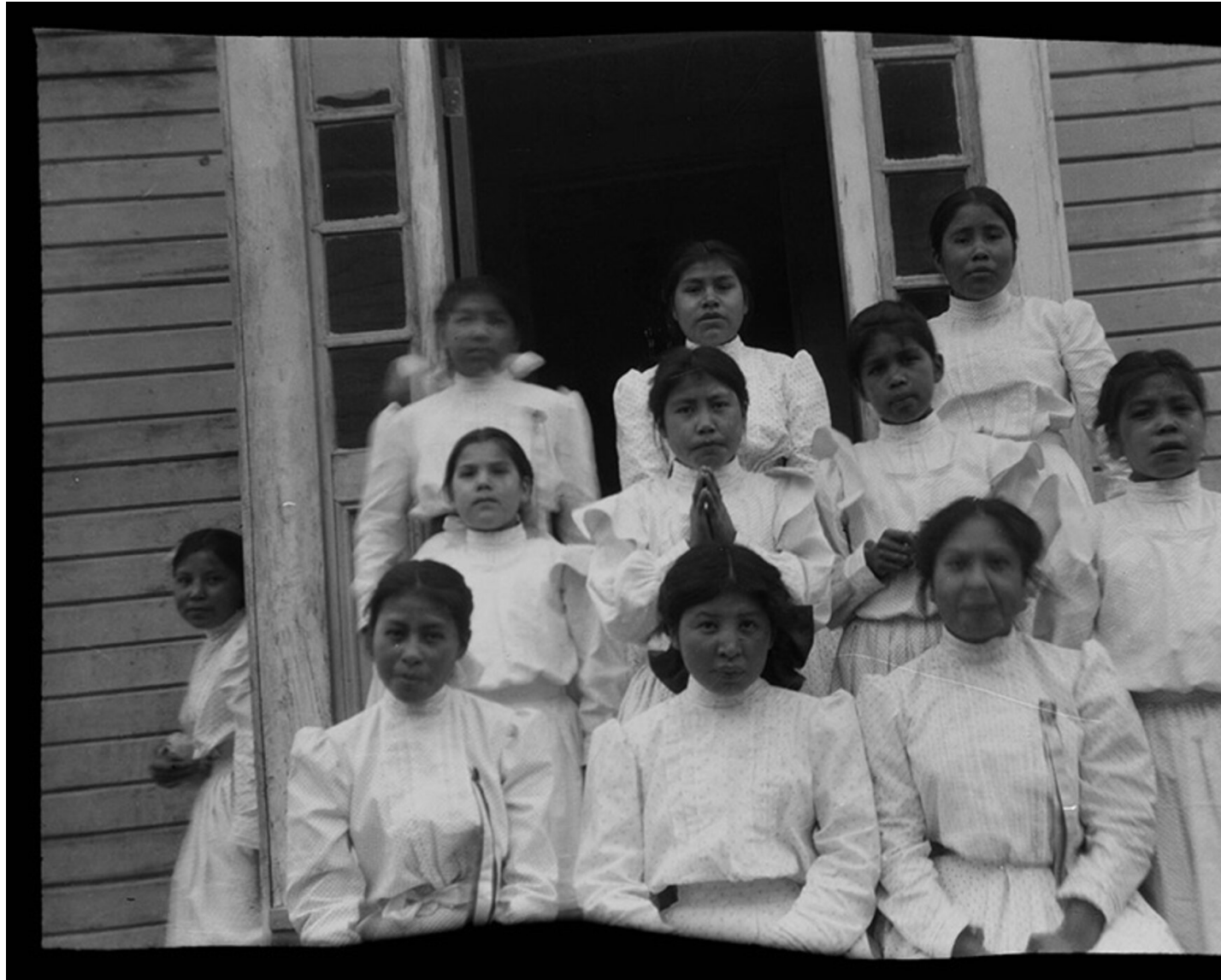
Girls at Kamloops Indian Residential