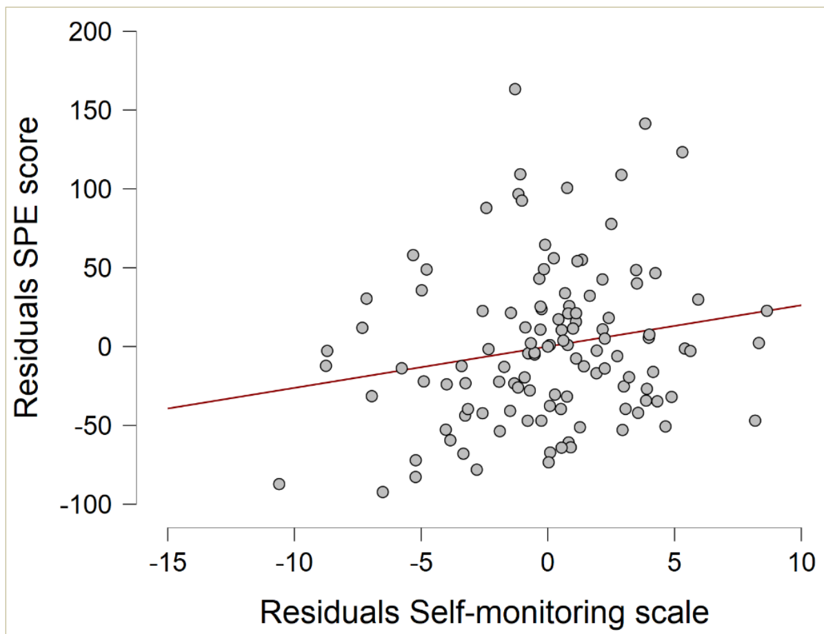
Figure 3: Partial regression plot showing relationship between self-prioritisation effect scores and levels of self-monitoring (n= 115). Generated using statistical package JASP (JASP Team, 2020).