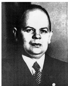
Figure 2: Wilhelm Ackermann, 1896-1962 [15].

In computability theory one defines primitive recursive functions as maps between non-negative integers employing only the operations of recursion and composition. For a more precise definition one requires the axioms that (i) the constant function n \mapsto 0 , (ii) the successor function n \mapsto n + 1 and (iii) the projection (1, \dots, n) \mapsto i ( 1 \leq i \leq n ) are all primitive recursive [16].