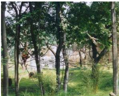
Figure 1 : An Orangutan and Gibbon utilising their shared enclosure at Zoo Leipzig, Germany. Environmental enrichment provided allows species-specific behaviours to be exhibited. (Fiby 2001)

“More than just physical space, environmental complexity or novelty, have been considered a basic element for enrichment” (Woolverton et al , 1989). An individual’s surroundings should allow for exploratory behaviours and different devices can be used to allow species-specific behaviours to be exhibited. These can take the form of tree trunks, branches or ropes, which provide the stimuli for such behaviours (Snowdon & Savage, 1989, as cited in Boere, 2001) (as seen in Figure 1). A specific example would be providing soft wood for marmosets ( Callithrix sp.) allowing them to use their specialised incisors for gauging (Boere, 2001).