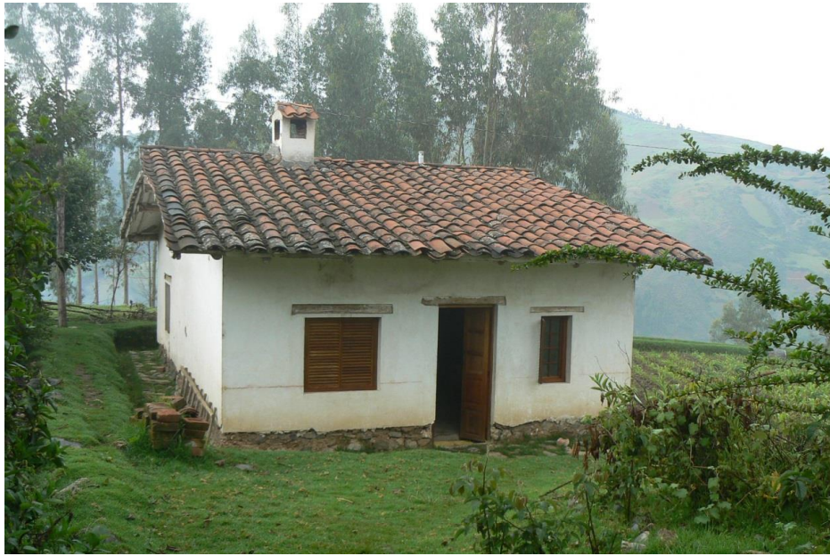
Plate 2: Tourist lodge.