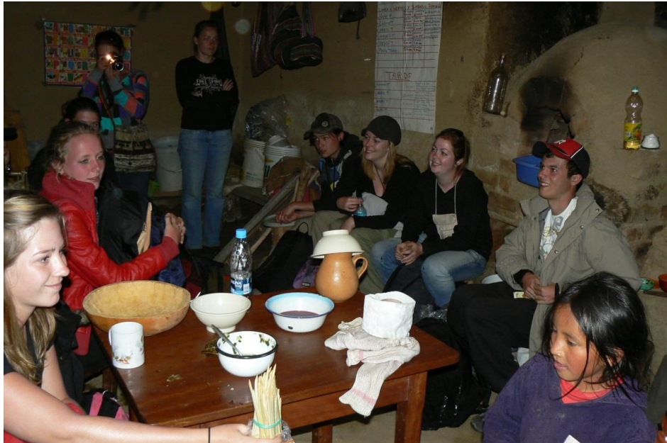
Plate 6: Negotiating authenticity: experiencing home life

authenticity (by measuring the I) tourist experiences and II) memories , using likert scales