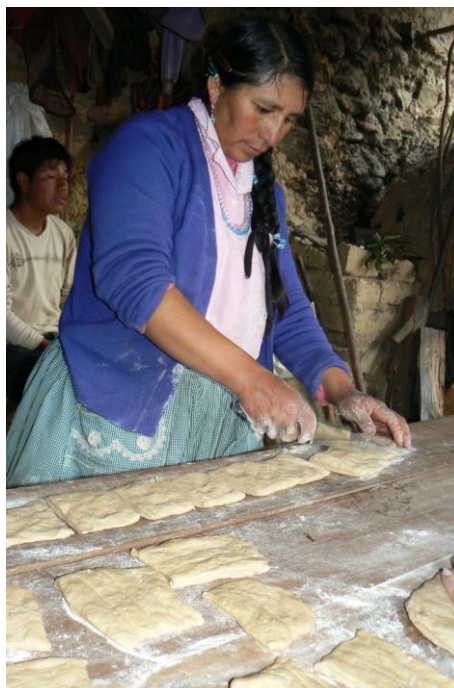
Plate 7: Preparing food