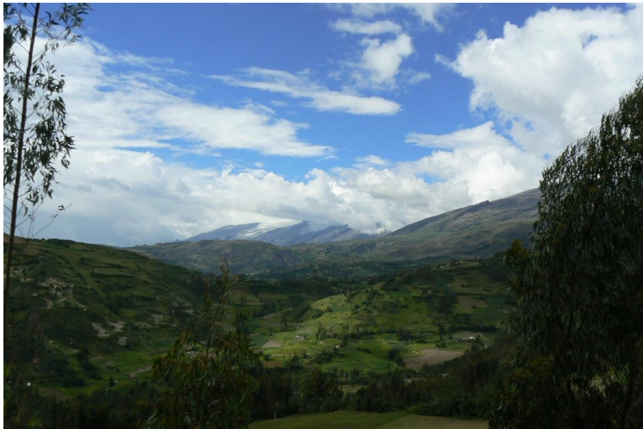
Plate 1: Landscape in Vicos

An NGO started a community-based tourism project in Vicos in 1999. Seven basic tourist lodges with beds, cold water and compost toilets were built on the field of seven Quechua families within the village Vicos. The first tourists were welcomed in May 2002 and nowadays this small-scale project receives almost a hundred international tourists a year.