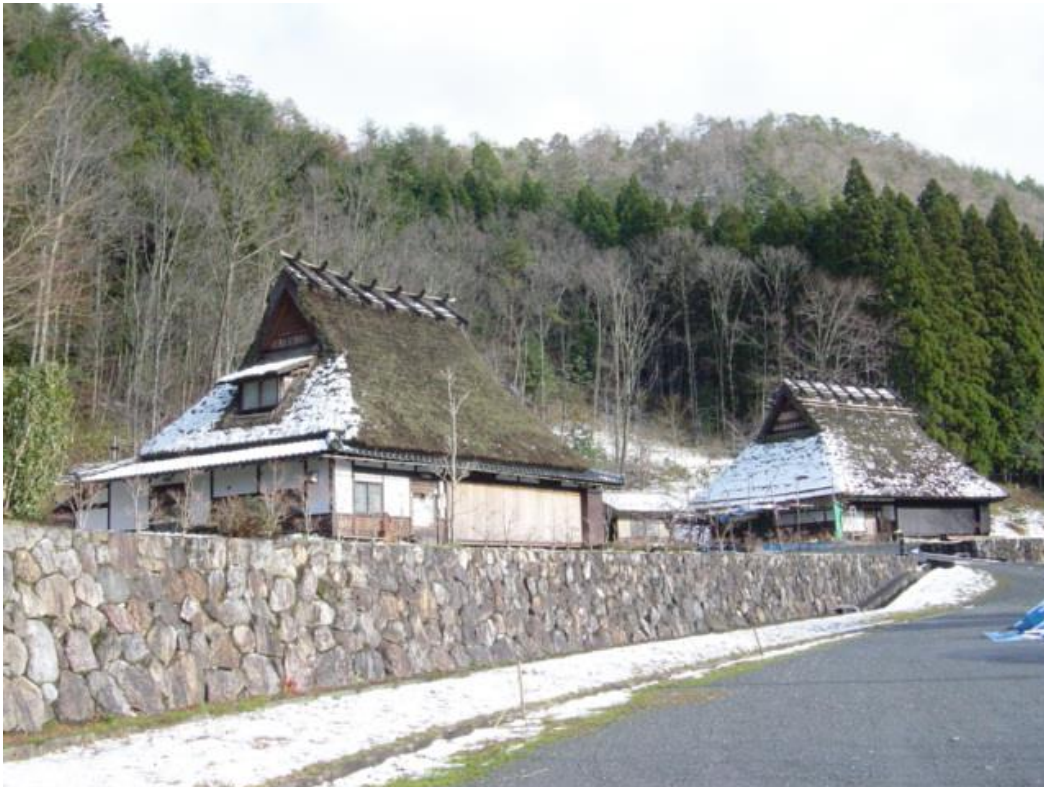
Plate 3: Traditional thatched houses in Miyama

revitalisation, Miyama people concentrated on reclaiming their cultivated land and, since 1989, the Miyama government has promoted tourism development by emphasising the area's distinctive rural environments. In order to initiate tourism development, Miyama Town obtained substantial funding from the national government because there was an entitlement under the terms of gurin tūrisumu policies.