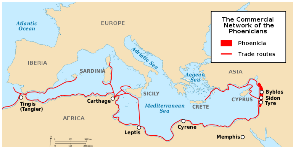
Figure 1: Phoenician trade routes