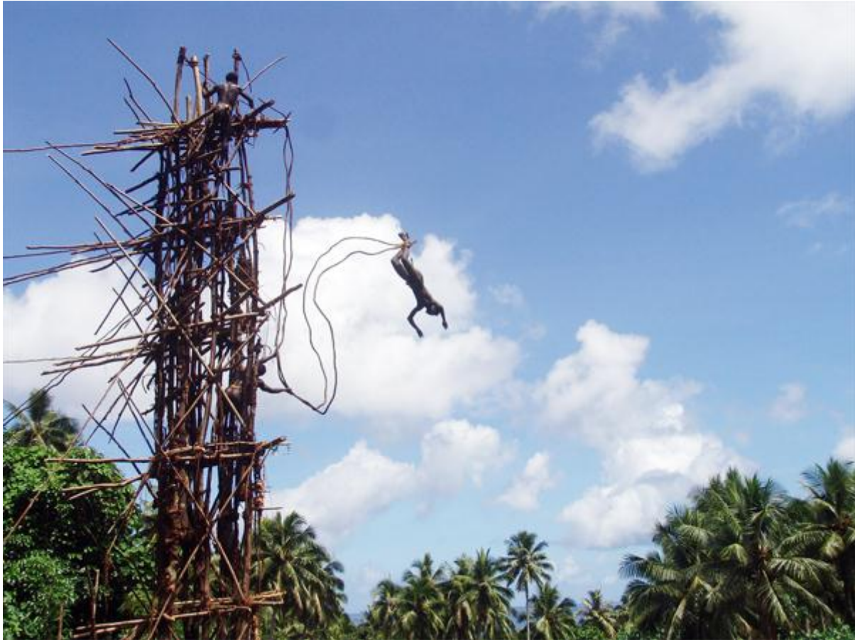
Plate 1: The Gol Ritual