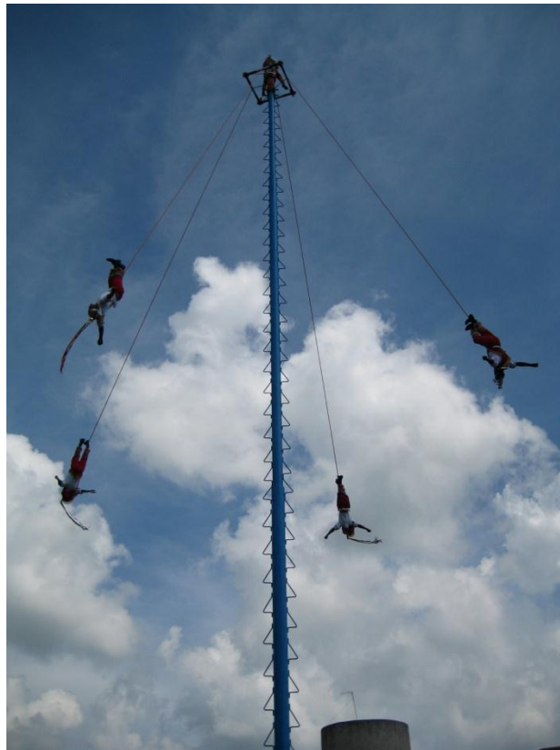
Plate 2: Voladores from El Tajín, Veracruz, Mexico, 2007.