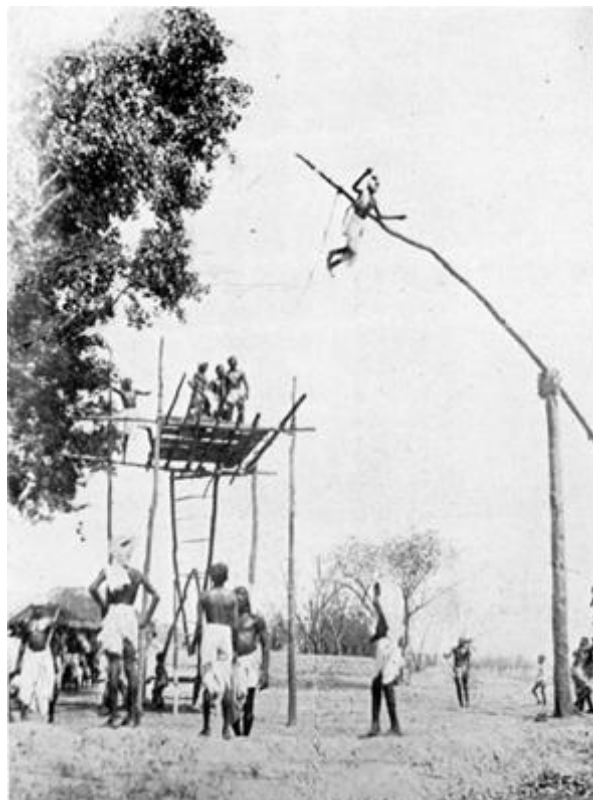
Plate 4: Hook swinging, India

The agonizing ritual involves a high pole, with an attached frame from where a person's suspended body hangs in hooks inserted to the skin of the back in a manner that allows rotating in a vertical plane. The pole ritual is still performed today at special occasions. A description of the customary ritual comes from J. Powell who eye witnessed and photographed the ritual in 1912 (see two of his photos above). Accordingly, the person who performed the ritual had by the means of expert helpers two iron hooks passed through the fleshy portion of the back, one on either side of the spine, just above the kidneys. With a rope attached to the hooks, he was then gently lifted up in the air from a tall platform, and was moved around on a rotating bar that lay across the top of an upright pole, forty feet tall. He was thus rotated from two to five minutes, or stayed suspended as long as he wished. Bells and garlands