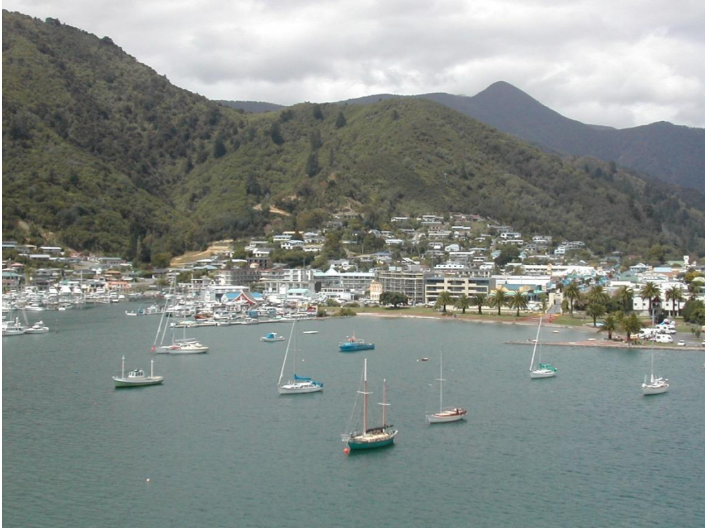
Plate 2: Town of Picton (South Island).