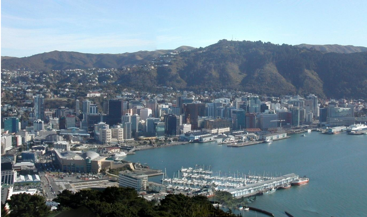
Plate 1. City of Wellington (North Island).