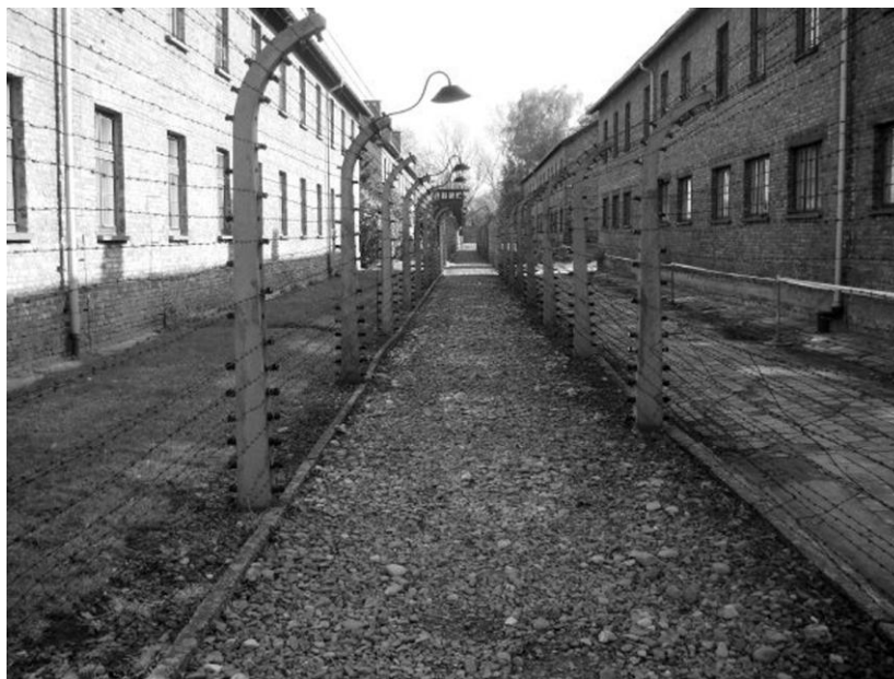
Plate Two: Wire Fencing