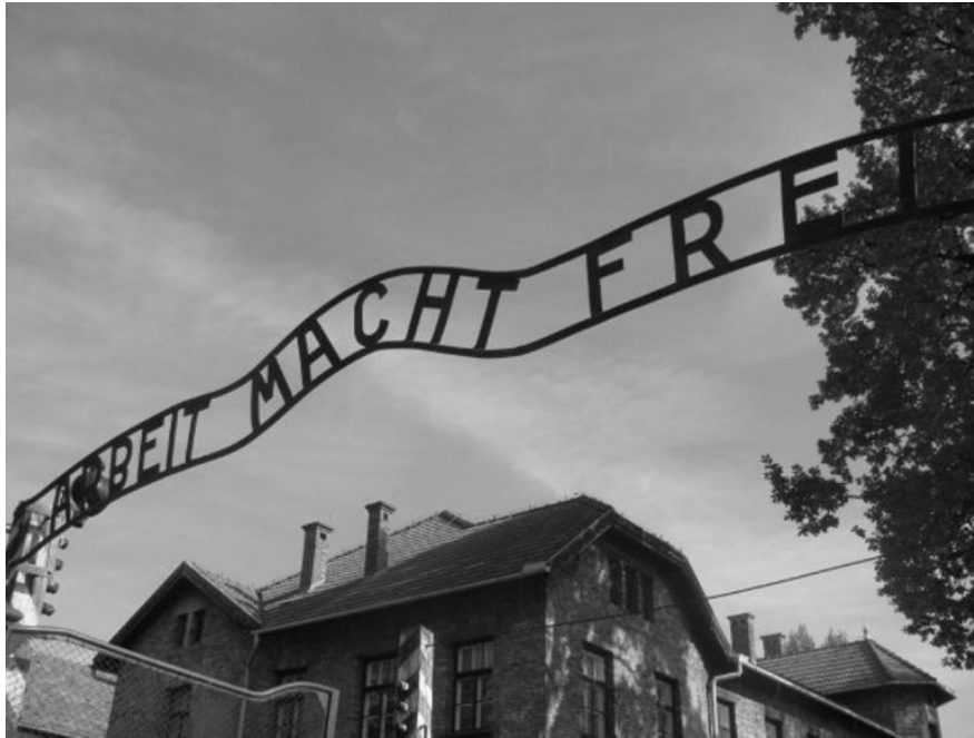
Plate One: The Gates of Auschwitz

Auschwitz despite concerns that, in doing so, she might have overstepped some line of respectful behaviour.