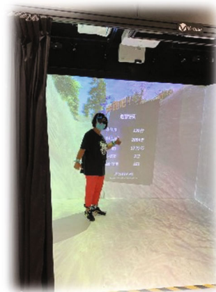
Picture C. Sensors attached to headset and limbs