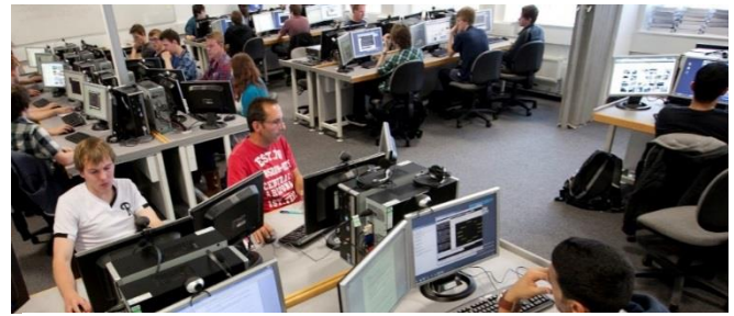
Figure 3: UoP cyber-range

It is important to recognise that, although researching maritime cybersecurity is crucial, it is not currently an easy area of research. As maritime cyber data is scarce, commercially sensitive, or