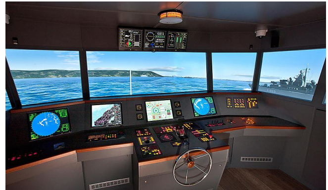
Figure 4: UoP ship simulator, main bridge

pertains to national security, and the equipment necessary to represent shipping environments is much more expensive than more traditional security labs, it may be overlooked as a research field. Providing a space where government industry and academia can pool resources and research efforts will be of significant benefit to all those involved with maritime. While this maritime-cyber lab aims to provide next generation research capabilities, it is not intended as a stand-alone solution. As seen in Figure 1, the Cyber-SHIP lab is meant to be integrated with other existing facilities. In this case, the lab is able to connect to other UoP facilities, including its cyber-range and ship's bridge simulator (Figures 3 and 4 respectively).